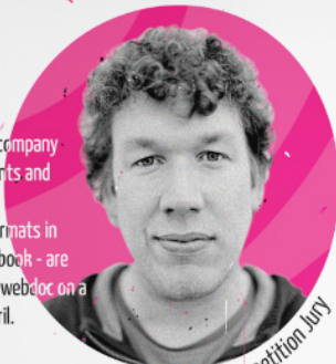
Feature Film Competition Jury