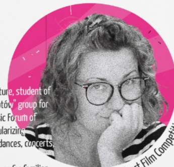
Short Film Competition Jury

She conducts dance and vocal workshops as well as meetings for families using traditional children's folklore. On a daily basis, she works as an educator at the Ethnographic Museum in Toruń.