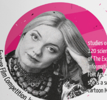
Feature Film Competition Jury

Doctor of philological sciences, professor of the department of folklore studies of the Taras Shevchenko National University of Kyiv. She is the author of about 120 scientific, educational, methodical, scientific, and popular publications, a member of The Expert Council on Intangible Cultural Heritage at the Ministry of Culture and Information Policy of Ukraine and also a member of the International Organization of Folk Art - an International NGO in consultative relations with UNESCO, as a Professor she is a scientific consultant for many cultural projects, particularly the Ukrainian 3D cartoon Mavka. Forest Song and the computer game The Forest Song.