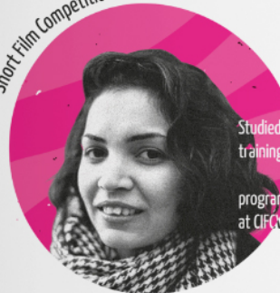
Short Film Competition Jury

Member of EFCA - Egyptian Film Critics Association. Worked as a film programmer in several film festivals in Egypt and was the Artistic Director Assistant at CFCW - Cairo International Film Critics Week in its 2nd and 3rd Editions.