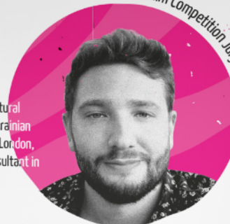
Short Film Competition Jury