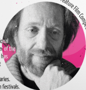
Feature Film Competition Jury

He produced several animated films and more than 50 documentaries. The films participated in and won awards at many leading international film festivals.